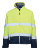
Fluoro Yellow /Navy

AVAILABLE IN SOLID COLOURS REFER TO PAGE 67